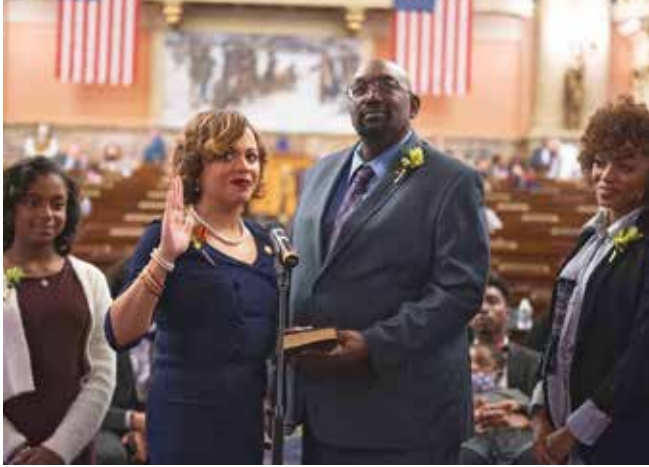
On December 13, I took the oath of office, alongside my family, to serve as your state representative.