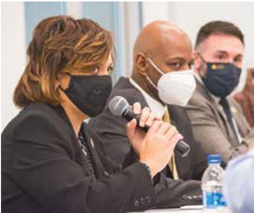
Increasing Participation in Academia Policy Hearing held at State College.