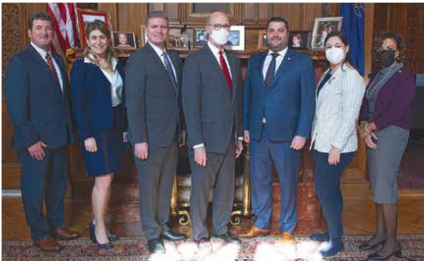
I served on the Escort Committee during Gov. Tom Wolf's final budget address.