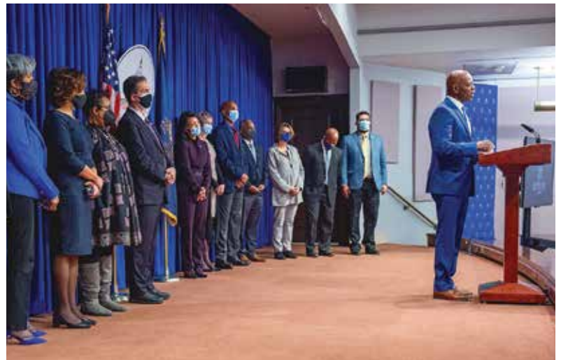
I joined my colleagues at a news conference to discuss prison reform.